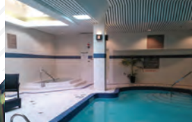
GLADSTONE HOTEL / 1214 QUEEN ST W TORONTO / ON M6J 1J6