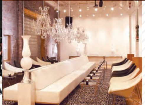
HILTON GARDEN INN TORONTO - DOWNTOWN / 92 PETER ST TORONTO / ON M5V 2G5