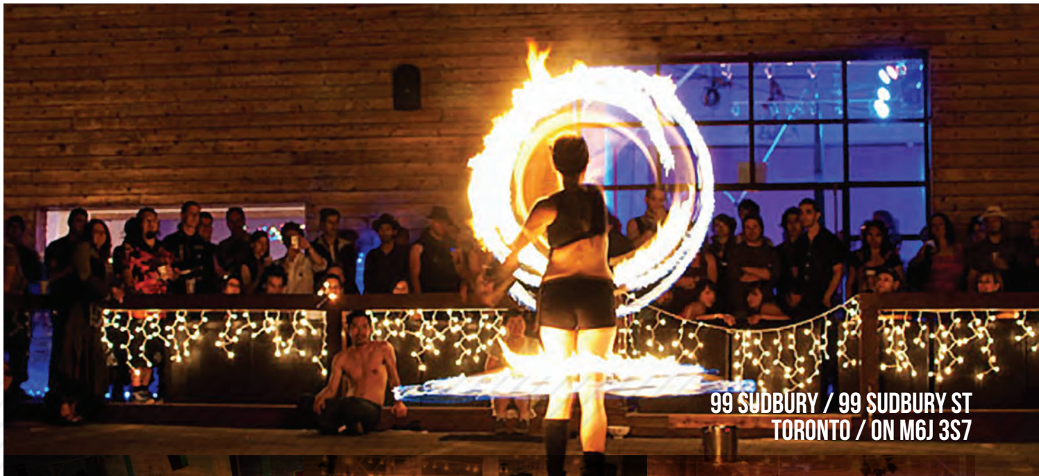
99 SUDBURY / 99 SUDBURY ST TORONTO / ON M6J 3S7